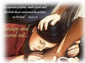
John 12:1-8 - Mary's Alabaster Box